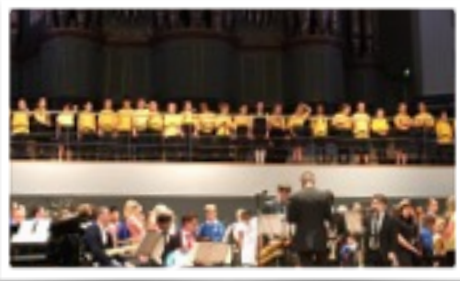
St. Mary's are easy to spot in their yellow t-shirts!

Music for Youth is the largest youth music festival and